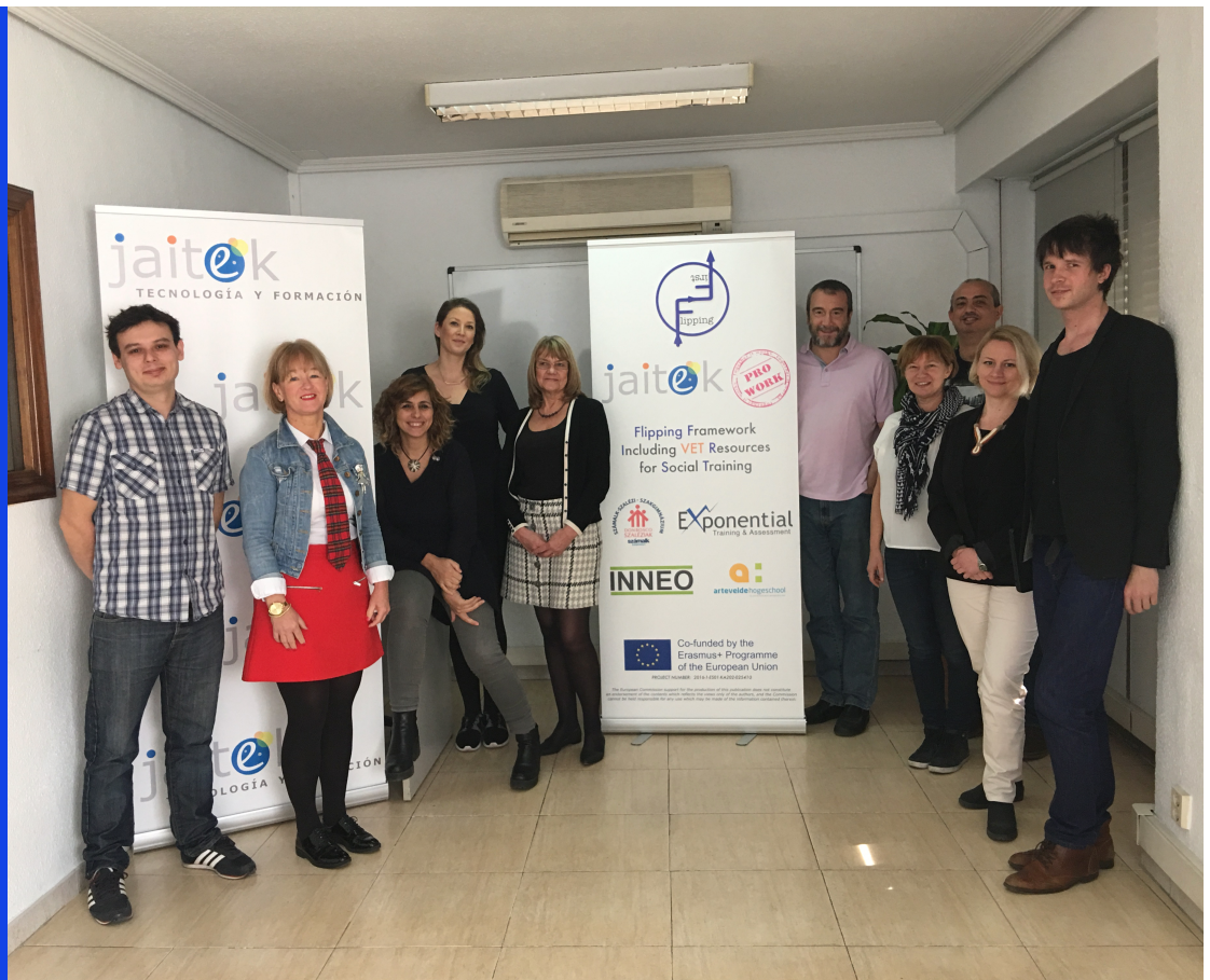
Fruitful staff training in Madrid. Using Flipping tools and working the methodologies