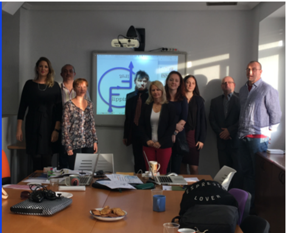
Kick-off meeting Flipping Framework Including VET Resources for Social Training