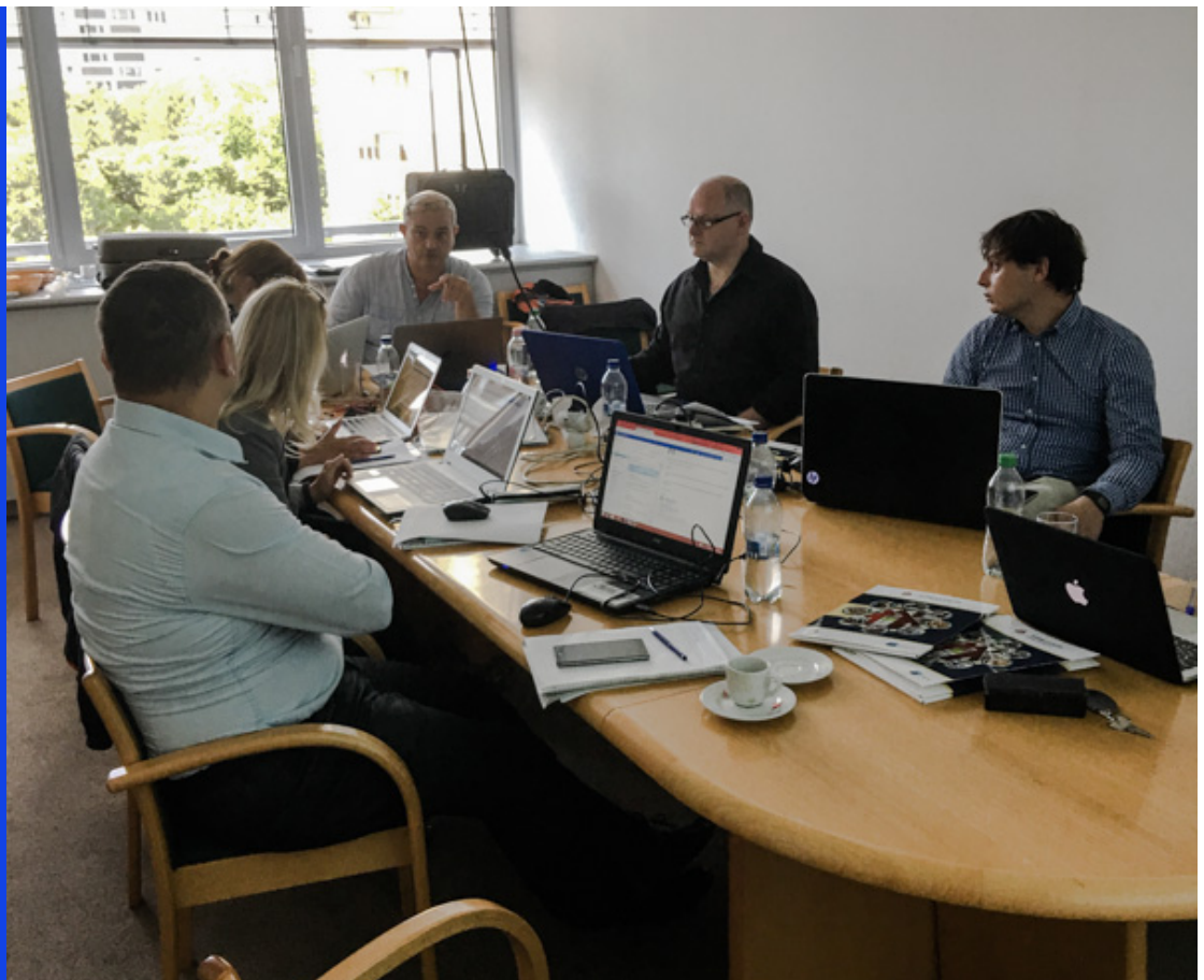
Last project meeting in Budapest, in September 17